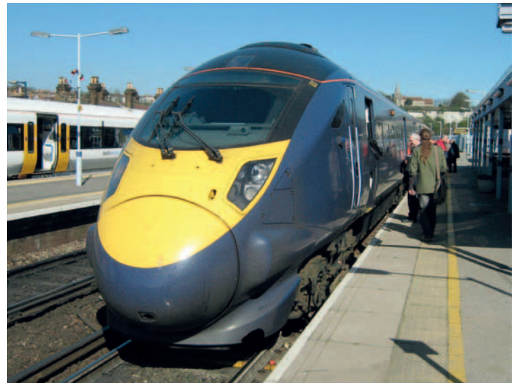
The new High Speed service

Departure times from Maidstone West are 06.56, 07.26, 07.56 and 19.13 with journeys from St Pancras at 06.25, 17.14, 17.44 and 18.14. The day return fare to St.Pancras is £37.50, but normal fares apply on journeys to Strood and Gravesend.